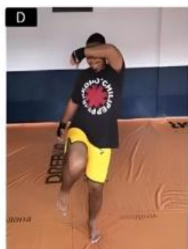
Figura 1- Examples of movements that can be used in specific warm-up. (A) Fighting guard. (B) Jab. (C) Cross. (D) Knee.