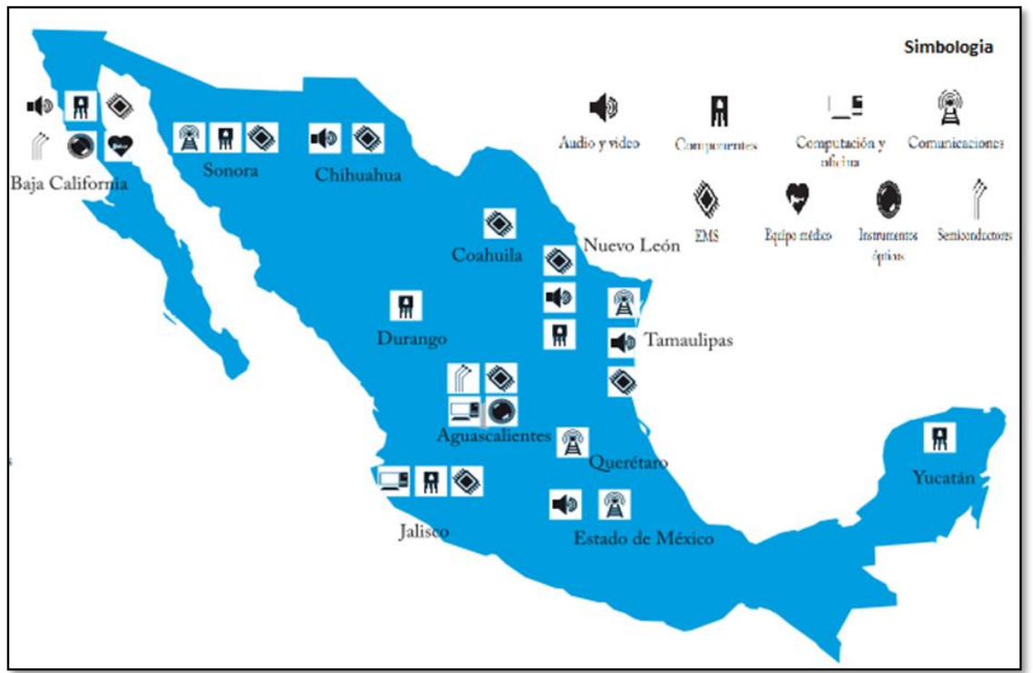
Figure 1. Areas in the electronics industry in Jalisco.

will be affected by these technological changes. This will lead to problems in the education system because the programs do not settle for dynamism in the labor market which if does not make the appropriate changes, it will be left behind.