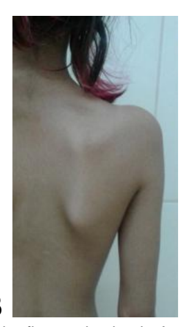
Figure 2: Muscular atrophy of the right shoulder girdle. Image in effect of the first evaluation in A and image 20 days after onset with symptomatic medications in B.

A retrospective study published in the Japanese Society of Internal Medicine showed good results associating an intravenous immunoglobulin and methylprednisolone pulse therapy, demonstrating an improvement in 9 of 10 patients (NAITO et al., 2012). Pain usually is not effective for the first one - Line analgesics, such as acetaminophen or non-steroidal anti-inflammatory drugs (NSAIDs), and the use of co-analgesics takes a long time to become effective in the acute phase (JEROEN et al. 2016). One of the best levels of pain relief treatment involves the concomitant use of NSAIDs and opioids, demonstrating good pain control in about 60% of individuals versus 31% and 2% of opioids alone and NSAIDs alone, respectively (SMITH et al. ., 2014). Resting and immobilizing the affected limb or extremity during the PTS pain attack phase may help decrease exacerbation. Another important point of view is the association of mental disorders and shoulder pain syndromes, demonstrated in a Canadian article where 18 patients, of 34 evaluated in the tested group, presented a depressive event and another 11