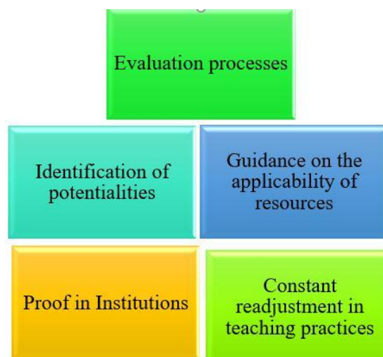
Figure 1: Evaluation effectiveness. Adapted from Minayo (2011).

According to Minayo (2011), a good assessment serves to reduce uncertainties and improve actions that provide relevant decision-making in educational processes. The assessment allows us to identify weaknesses, strengths, and all elements that directly affect performance. The evaluations objectively serve as a subsidy for verification in institutions, government, and society, in general. They also serve to guide funding agencies on the best use of resources and projects, aiming at collective and institutional development. Finally, the evaluations serve to improve and adapt them to school practices. The following illustrates, in Figure 1, the elements that make up the effectiveness of the evaluation processes: