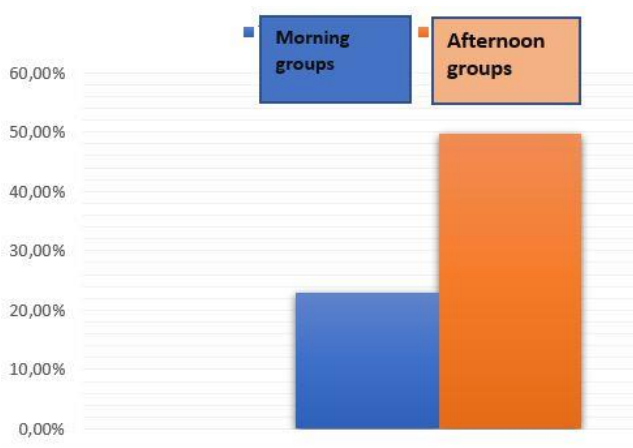
Figure 2: Withdrawal in the discipline of chemistry.

The results in Figure 2 showed that the dropout percentage reached over 20% of students in the morning shift, and in the afternoon shift it reached close to 50% of students, which represents half of the first-year class of the high school. The dropout rates were high, so they were even more worrying in the afternoon shift.