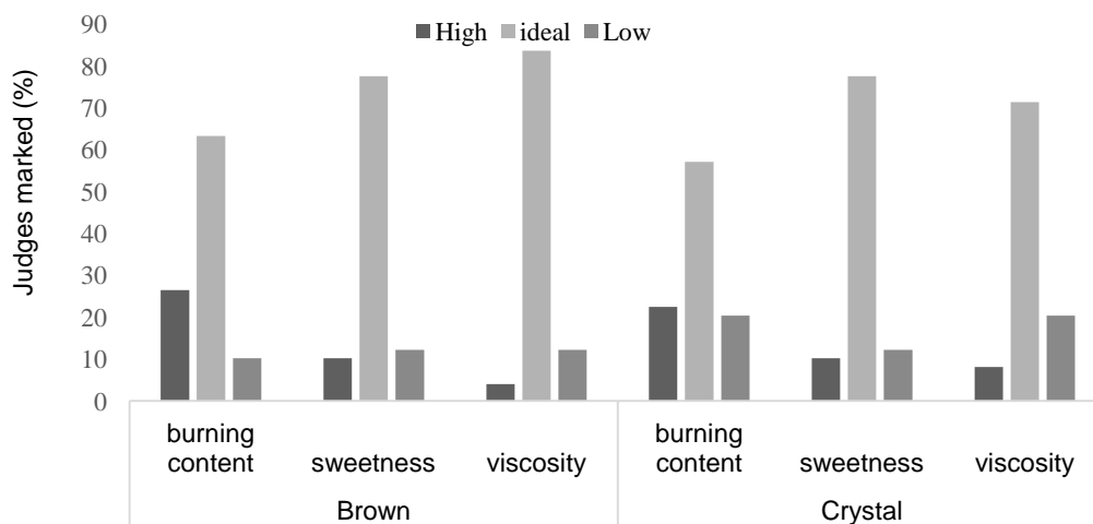
Figure 1. The ideal range for burning, sweetness, and viscosity in jams sweetened with crystal and brown sugar.

viscosity, by a greater number of judges. The number of judges who considered the ideal sweetness did not vary between the jellies made with crystal and brown sugar.