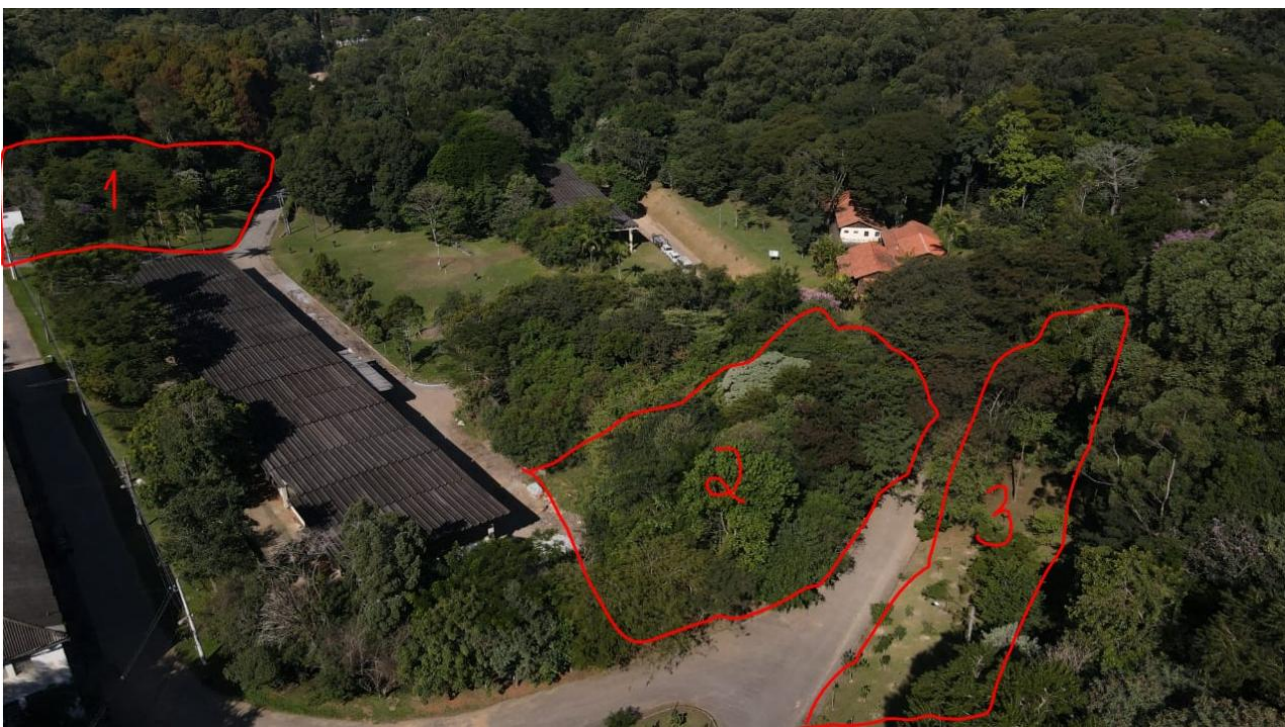
Figure 1. Overview of the three fragments that comprise the São Paulo-Tottori Friendship Forest.