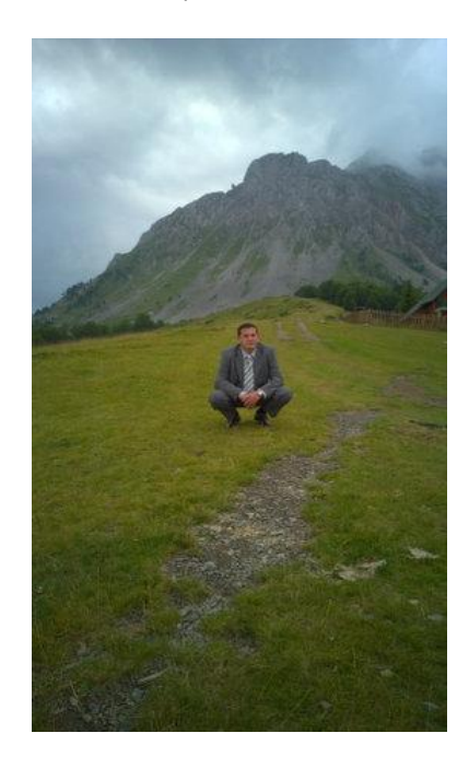
Figure 5 . In the heart of nature - Author of text GR on the plateau Štavna below the Koma (August 2014).

Economic success depends on the quality of the environment and of satisfying the needs of tourists, and the tourists will their expectations and needs met just in case of suitable quality.