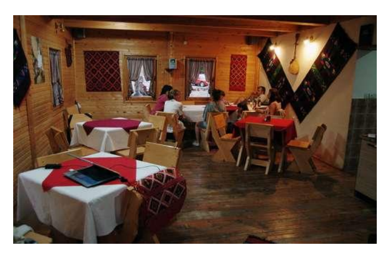
Figure 2. Restaurant with traditional cuisine - exudes a relaxed and pleasant atmosphere (www.meetmontenegro.me).