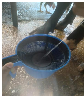
Figure 1. The black background mug test.

The animals from both farms were subjected to the two main field tests, non-laboratory-based, to indicate abnormalities in the mammary gland. Both farms were visited in the spring, when milk samples were obtained during milking (Figure 1), to be later examined under the black background mug test. The objective was to verify if there would be changes in the milk, such as the presence of lumps, blood and pus.