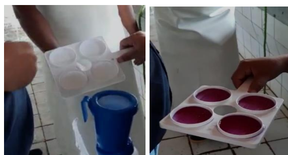
Figure 2. California mastitis test, a) individuality sampling by ceiling, b) reaction reading.

After that, milk jets were collected with a racket for the California Mastitis Test. For each mammary quarter, 2 milliliters of a reagent were added, under circular movements for 20 seconds. Then, it was checked if the formation of gel occurred, with a reduction in the fluidity of the samples. Each mammary gland of each cow was classified as 0, +, ++ or +++ (Barnum and Newbould, 1961), Figure 2.