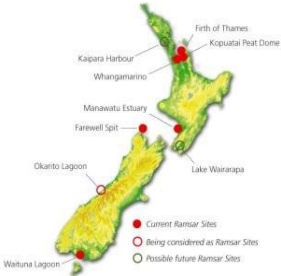
Figure 1: Map of wetlands in New Zealand.